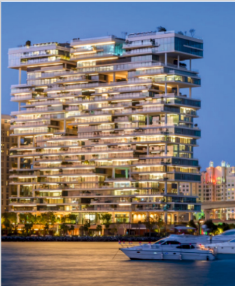
ONE AT PALM JUMEIRAH, DORCHESTER COLLECTION, DUBAI

OMNIYAT's impressive portfolio, with a combined gross realisation of over AED 17 billion, includes stars such as The Opus by OMNIYAT, One at Palm Jumeirah, Dorchester Collection, Dubai and The Residences, Dorchester Collection, Dubai.