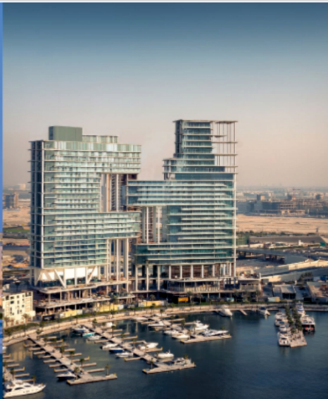
THE RESIDENCES, DORCHESTER COLLECTION, DUBAI