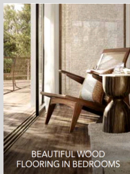
BEAUTIFUL WOOD FLOORING IN BEDROOMS