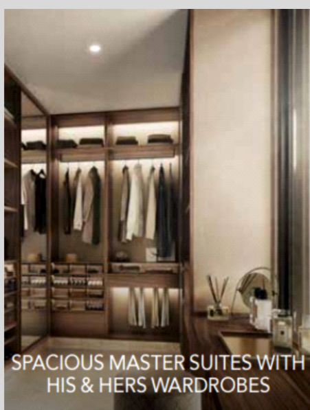
SPACIOUS MASTER SUITES WITH HIS & HERS WARDROBES