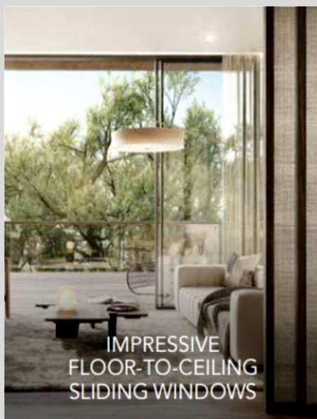
IMPRESSIVE FLOOR-TO-CEILING SLIDING WINDOWS