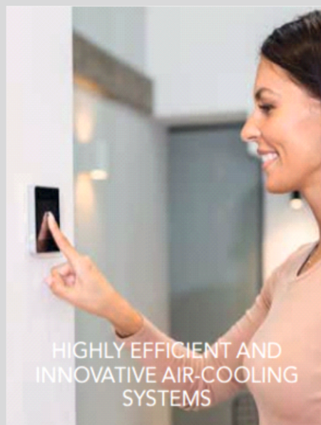
HIGHLY EFFICIENT AND INNOVATIVE AIR-COOLING SYSTEMS