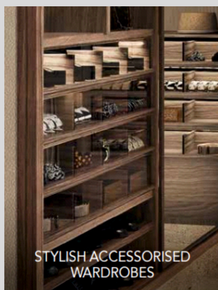
STYLISH ACCESSORISED WARDROBES