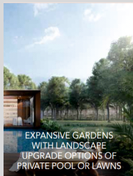
EXPANSIVE GARDENS WITH LANDSCAPE UPGRADE OPTIONS OF PRIVATE POOL OR LAWNS